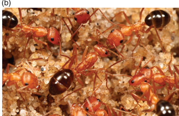
Fig. 1. Cataglyphis tartessica brachypterous queen (a) and worker-like ergatoid queen (b). Although brachypters are easily recognisable because of their size and distinct morphology, ergatoids can only be distinguished from workers based on the presence of small thoracic tegulae (indicated by the arrow).

found colonies through independent colony foundation (Jowers et al., 2013). Yet brachypters' thorax is segmented markedly different from the workers. In contrast, ergatoids are only distinguishable from workers by the presence of small tegulae (Fig. 1). Out of nine morphological traits measured by Amor et al. (2011), seven were significantly smaller in ergatoids than in brachypters (see also Amor & Ortega, 2014). Although, at the population level, more ergatoids than brachypters are produced, the proportions of colonies headed by each are fairly equal (Amor et al., 2011). Moreover, behavioural observations showed that, during fission, almost all the cocoons containing brachypters but only one-third of those containing ergatoids are transported to the daughter nests. After emergence, these individuals compete to become the next queen of the daughter nest. In contrast, the ergatoid that emerge from the cocoons not transported to the daughter nest are eliminated by the workers probably to maintain monogyny (Amor et al., 2011). This differs from other species (Ocymyrmex: Forder & Marsh, 1989; Eutetramorium: Heinze et al. 1999; Mystrium: Molet et al., 2007) in which unmated ergatoids participate to non-reproductive tasks such as nursing and foraging. Therefore, the excess of C. tartessica ergatoids that are eliminated at the early adult stage may be viewed as 'useless' by the colony. In a previous study, we proposed that these individuals were selfish individuals that escaped the